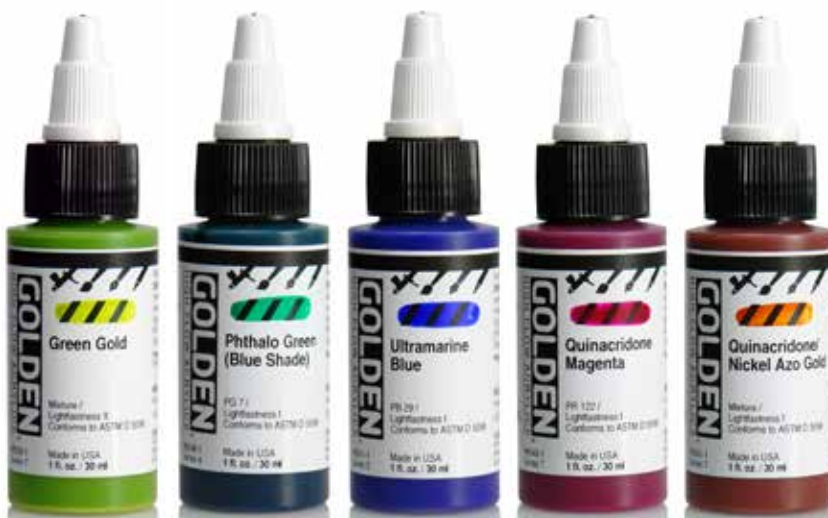
GOLDEN High Flow Acrylics are available in 1, 4 & 16 ounce containers.

Visit http://www.youtube.com/goldenpaints for more on GOLDEN High Flow Acrylics.